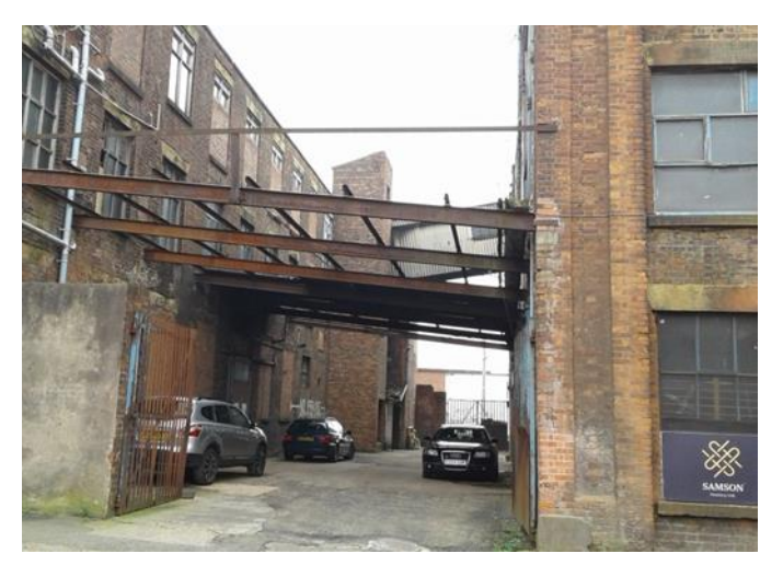
Figure 1: The address of this derelict factory was still listed in an online supplier list, although the company was actually trading from new premises.

In parallel with this outreach work, we also compiled a database of 180 textile companies within Greater Manchester, starting with lists from the original Alliance-New Economy project in 2014, updated with anecdotal information from contacts or observations from fieldwork visits. We also secured valuable initial information from two retailers contacted through HWW's involvement in the UK's Ethical Trading Initiative, who were sourcing clothes or homewares from the region, and this helped to inform our initial outreach work. Collating company addresses then revealed particular neighbourhoods with a concentration of companies, starting with the significant clusters of knitwear manufacturers in central Manchester (Ancoats, Ardwick, Cheetham Hill, Longsight).