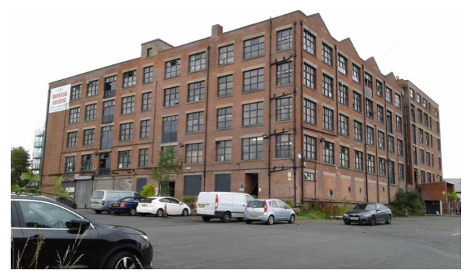
Figure 3: a large tenement building which has clearly housed many different companies over the years.

We began by identifying clusters of factories in key locations, and looked for evidence that the