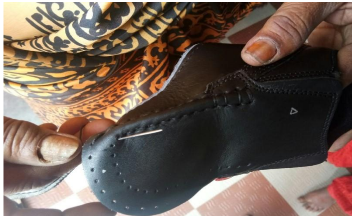
Figure 2: Homeworker stitching leather upper for Pentland supplier

In 2016, Pentland Brands, responding to Stitching our Shoes a research report produced by Homeworkers Worldwide and Cividep India, decided to take steps to address these issues. They partnered with HWW and Cividep, and crucially with one of their suppliers in the region that disclosed to Pentland that it did indeed use homeworkers in the manufacture of some of their shoes. There were four stages to the project, which ran between 2016 and July 2019, and the total budget was £23870.