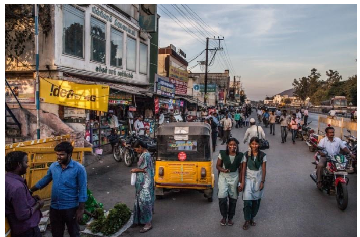
Figure 1: Ambur, leather manufacturing town in Tamil nadu

This report describes a project working with homeworkers involved in the production of leather footwear the Ambur-Vaniyambadi-Ranipet area in Vellore District in Tamil Nadu, in the south of India. This region has traditionally been the home for many tanneries and has increasingly turned to production of complete shoes or the uppers of shoes for export. Part of the workforce assembling these shoes for export are women working at home, usually hand-stitching the uppers of leather shoes.