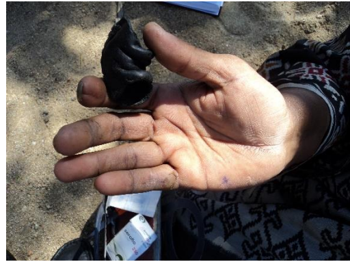
Figure 4: Homeworker showing homemade protection against needle injuries.*

Child labour was not found within the project, but other studies have shown it is closely linked to wages, as parents may need to enrol children in production if they cannot meet their family needs through their production alone.