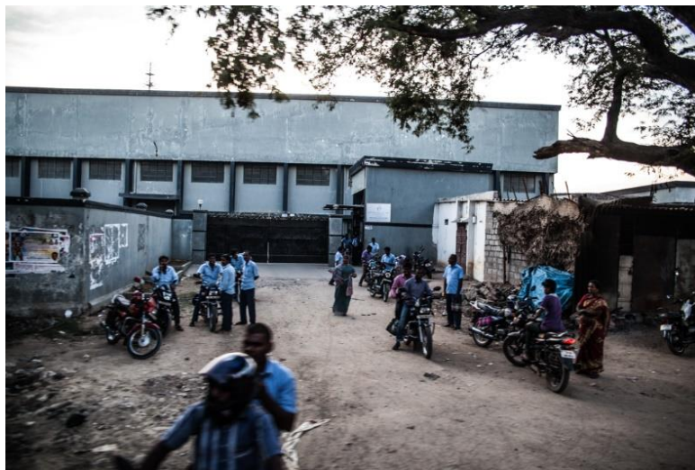
Figure 5: work is distributed by intermediaries, usually men*.

Child labour was not found within the project, but other studies have shown it is closely linked to wages, as parents may need to enrol children in production if they cannot meet their family needs through their production alone.