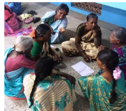
Figure 6: Group meeting for homeworkers organised by Cividep*

A sample of the homeworkers involved in this supply chain were consulted at several points during the project: 30 individual interviews were completed with